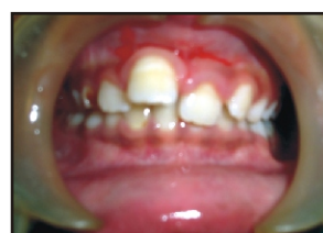
Figure 1 Irregularly placed maxillary central incisors with proclined right maxillary central incisor and retroclined left maxillary central incisor

An eight year old boy reported to our clinic with chief complaint of dirty teeth. The Patient gave no significant medical or dental history. On intraoral examination, patient had irregularly placed maxillary central incisors with proclined right maxillary central incisor and retroclined left maxillary central incisor (Figure 1).