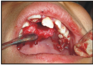
Figure 3. Intraoperative photograph during mesiodens removal