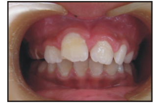
Fig.6. Postoperative photograph after 2 weeks