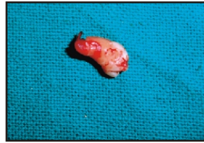
Figure 4. Surgically removed mesiodens