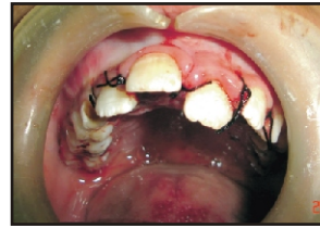
Fig.5. Postoperative photograph with sutures placed